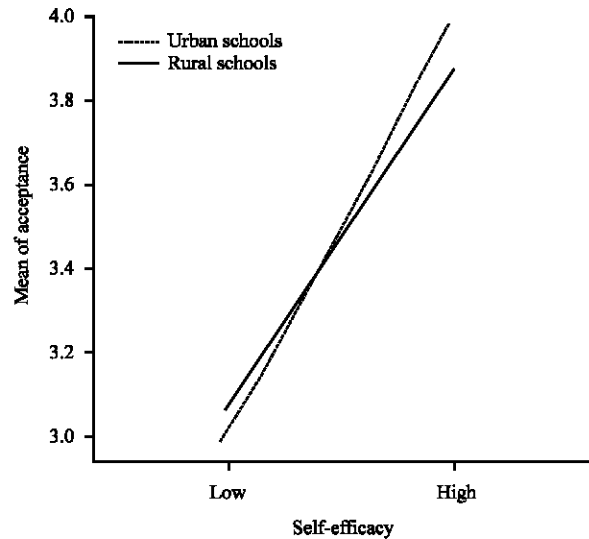
Fig. 1: Plotting interaction between self efficacy and school location on the acceptance of courseware

Figure 1 shows the interaction between self-efficacy and location of school with regards to acceptance of courseware as well as their relationship to be negative. The findings show that there is a strong relationship between the self-efficacy variable and the level of acceptance when the location of a school is urban compared to a school whose location is rural. Overall, the