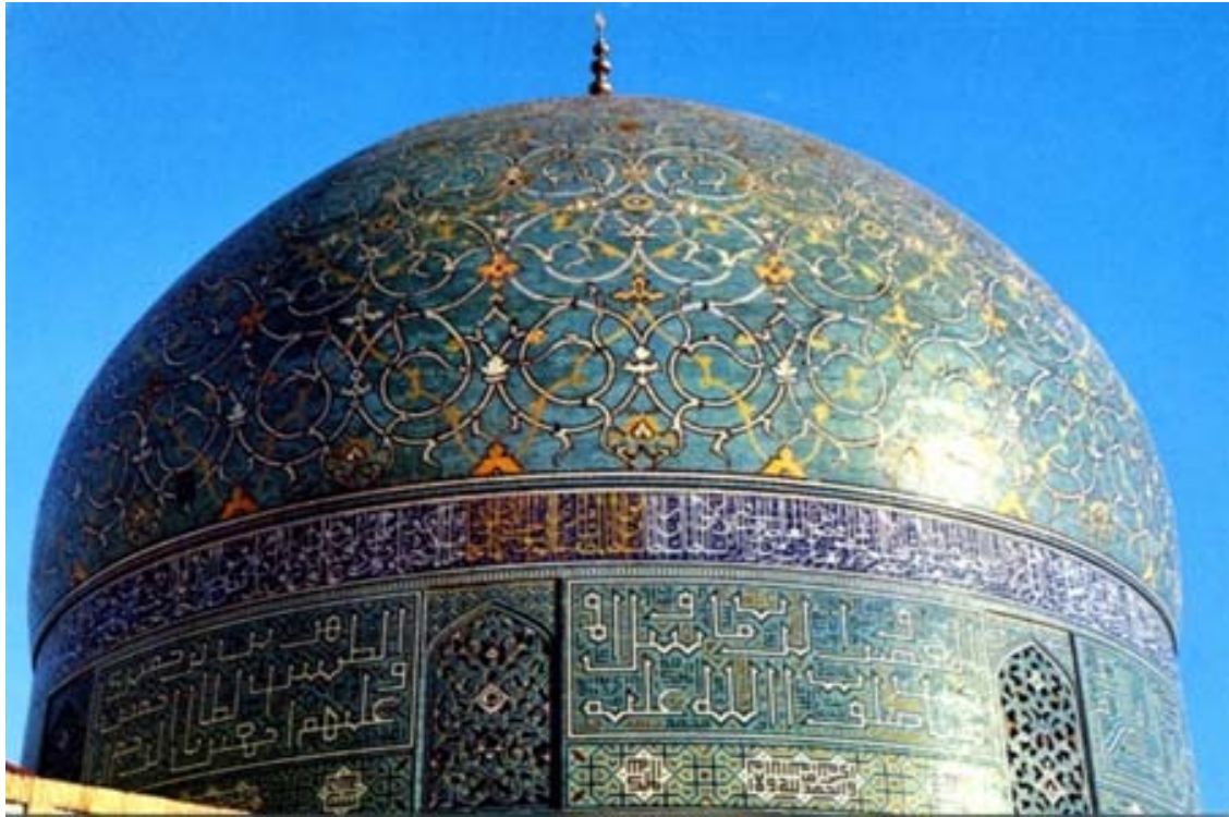
Fig. 8: Outer coverage of the dome, 4bagh School-Eslimi and Khataee concentric, converged branches-the concept of the tree of life

such as “Thaqalayn” and comparison between Imam and some prophets, narrated by the Prophet Muhammad (S. A. W) which emphasizes on the position of Velayah. The inner coverage of the entrance for the school is comprised of geometrical elements around the center of the coverage with a solid geometry and point symmetry. This coverage and other samples of Mogharnas that provided a geometry of stars and polygons can undermine referrals to the universe. “Among geometrical figures, those with star or Shamsheh mostly remind us the sky. The network of concentric circles under Figure of star nodes reminds the accurate position of the orbits of the stars and apart radius of Shamsheh is like beams in the starry sky. Although these nodes are not a detailed picture of stars and celestial orbits explained in the literature of astronomy on those days but only simple geometrical abstracts as a metaphor” (Golru, 2010). Shamsheh as the canonical element over the coverages, is a referral to the sky. In present sample, we see more significant expression of it by help of decorations. Making Shamsheh with golden yellow tiles strengthens the symbolism of subjective Sun at the heart of the coverage and the focus of the perspective (Henry, 1998). However, the intrinsic meaning of the Sun could be guessed from the content of the