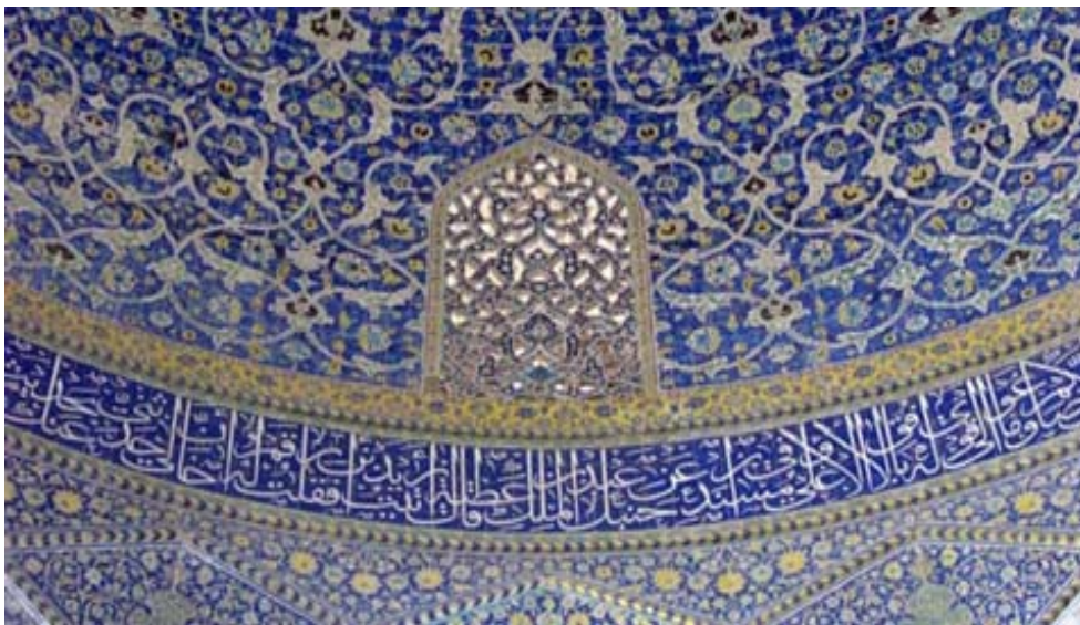
Fig. 7: The upper inscription of the internal coverage of the dome, under reticular site-the story of the declaration of Executorship of Imam Ali based on the words of the prophet and the Story of Qadir Khom

4Bagh Abbasi school, Isfahan: Outer coverage of 4bagh school, like Imam mosque is covered by Eslimi and Khataee concentric, converged branches that shows the concept of the tree of life and movement from exuberance to unity. The building inscription of the drum includes blessings upon the prophet of Islam as well as other prophets and the name of the Prophet Muhammad and Imams. Also an inscription is placed over reticular site