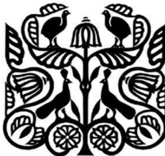
Fig. 4: The figure of peacock with the tree of life from sassanid era

Figure of "tree of life" is also of the most important individual, symbolic figures in Iran's Sassanid era art. Epidemic presence of this tree in many Iranian artworks is significant. The tree of life has been presented in many artworks left from ancient times, especially golden and silver pots, textile, molding and other Sassanid artworks between 2 peacocks in front of each other. In ancient traditions, the dragon (snake) as the symbol of evil is