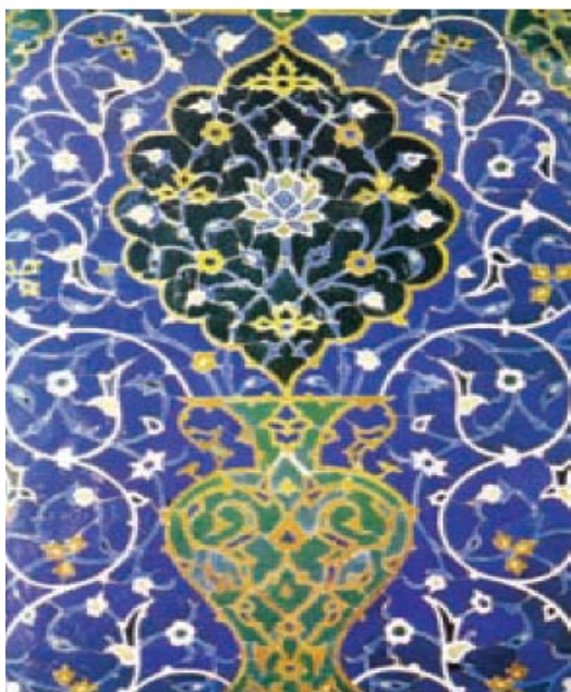
Fig. 1: Decorative tile with Eslimi patterns in Southern porch of Isfahan grand mosque (Jame' Isfahan)