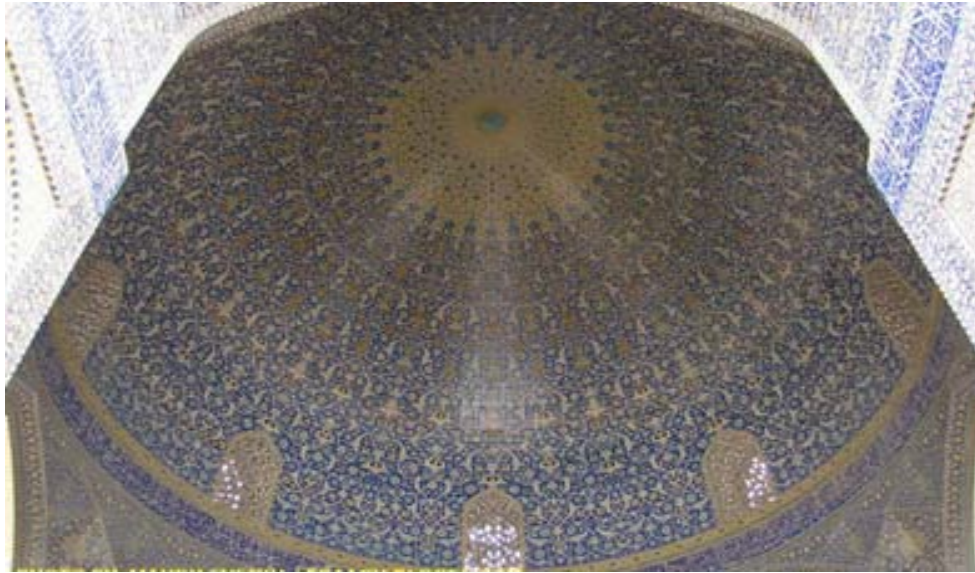
Fig. 6: Internal coverage of Isfahan Imam mosque concentric and converged Eslimi and Khataee branches movement from exuberance to unity-the image of the Eden