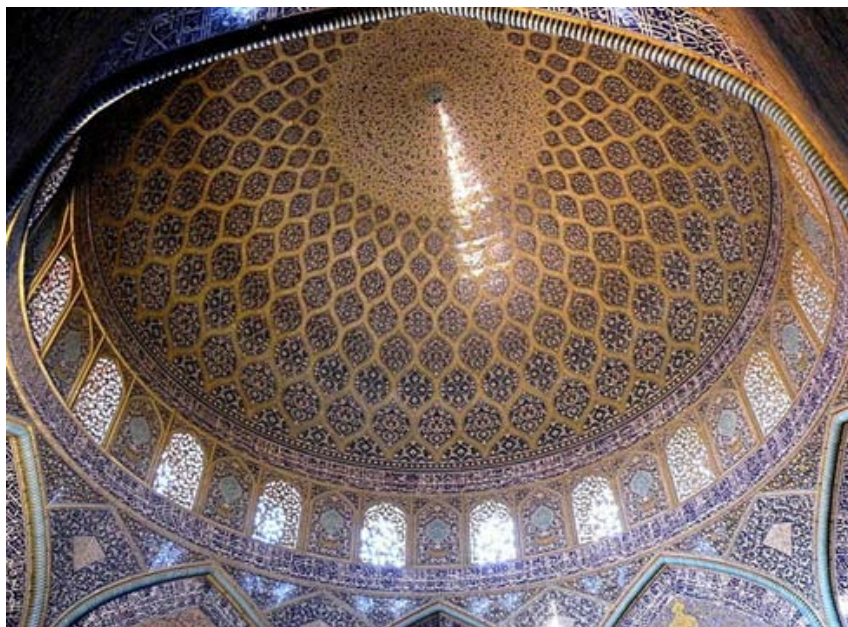
Fig. 9: Inner coverage of the dome, Sheikh

regard. Installation of these inscriptions over the façade of the school is considered as a symbolic emphasis on the position of Imam Ali as the scientific mentor.