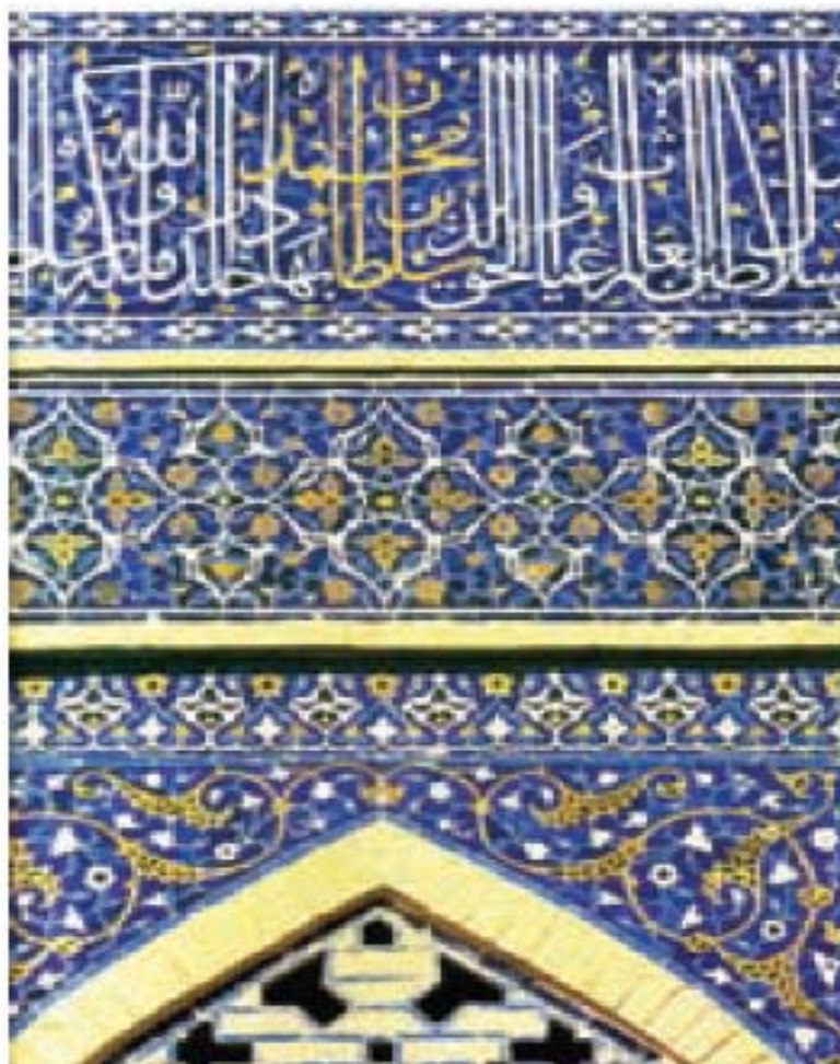
Fig. 3: A part of decorations and calligraphy of Teimuri era, around Isfahan Jame' Mosque's yard

tightly connected with geometry, proportionality and mathematical relations and the proportion of the letters and the degree of curling was based on a certain order. Calligraphic inscriptions were of significant decorative elements in most of Islamic era buildings (Fig. 3).