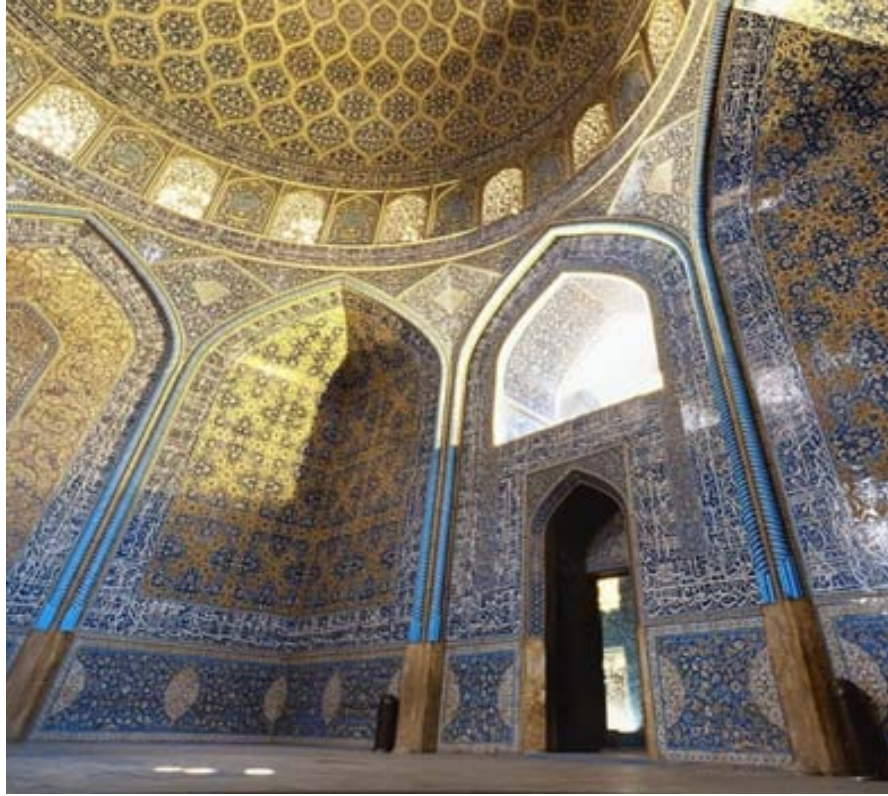
Fig. 10: Decorative curls of layout, continued towards the floor, Sheikh Lotfollah mosque, Isfahan