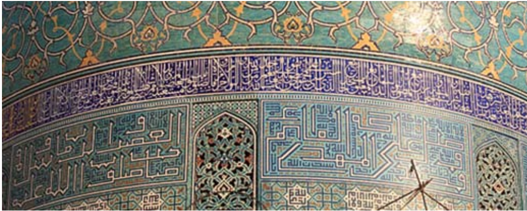
Fig. 5: The building inscription-Imam mosque Isfahan-blessings upon the prophet, Imams and particularly over 12 th Imam

Therefore, dome reminds an abstract tree, grown over a long cylinder with a high volume and shows a giant emerald ball over the horizon of the city. So, the dome with its distinguished cyan color and height is at the spotlight of the city perspective.