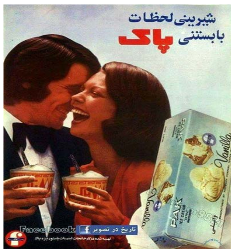
Fig. 3: Pak ice cream

(sweet moments with ice cream) is azure blue but Pak in color of the word clear and distinct. Azure (Iranian blue) is one of the shades of blue is the color of lapis lazuli and Iranian myth and reveals the originality open.