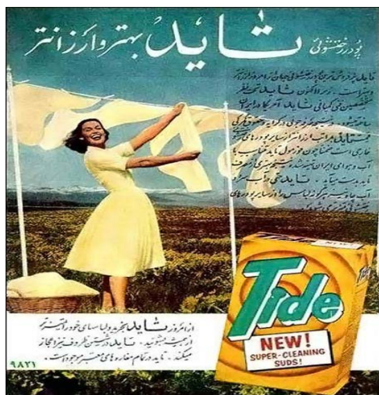
Fig. 1: Tide laundry powder

and the great attraction once the audience tries the product movement. In the bottom right corner, the image of the product in the field Tide orange and red circular lines that are associated with water waves Tide word written with green blue and red in the white box «super cleaning suds is located. Written in English on the product as well as external confirmation of the product should be labeled that it has the myth of foreign goods in the mind of the audience to depict. This primarily reflects myths and their semantic representation of power and in the second chain, “foreign goods” can represent the value system is oriented. Foreign goods means having wealth, taste and social belong to the top floor and the chain can also note the implication in the ad text (Kamran, 2007).