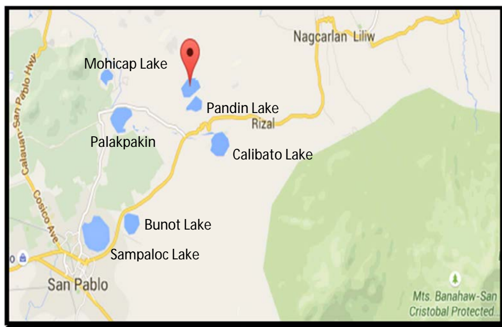
Fig. 1: Yambo Lake and the Other Crater Lakes of San Pablo City

hydroelectric power. The importance of the water resource is underscored by the fact that over 90% of the liquid freshwater on the earth's surface is contained on lakes (Shiklomanov, 1993; International Lake Environment Committee, 2007; Nakamura and Rast, 2011, 2012). Lakes are also crucial to the preservation of the global biodiversity and ecosystem since they are a habitat for a variety of flora and fauna and are critical in natural processes such as climate mediation and nutrient cycling. Conversely, human activities such as food production, increasing population, settlement, urbanization and industrialization have degraded the water resource. Presently, many lakes around the world suffer from problems such as eutrophication, acidification, toxic contamination, water-level changes, salinization, siltation, overfishing and exotic species/weed infestation (Kira, 1997; ILEC, 2005). For instance, the Global Environment Facility-Lake Basin Management Initiative's (GEF-LBMI) study of 28 major lakes around the world from 2003-2005 concluded that the condition of many lakes is not improving (LakeCon, 2011).