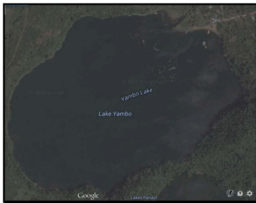
Fig. 2: Satellite Photo of the Fish Pens/Cages in Yambo Lake

In the past, Yambo Lake was principally utilized for aquaculture, particularly tilapia farming via floating pens/cages. In the seven crater lakes, aquaculture was first introduced in Bunot Lake in 1976 after the successful introduction of tilapia pen/cage farming in Laguna de Bay by the LLDA in 1974 (Radan, 1977). In time, tilapia pen/cage farming spread to Yambo Lake and the other crater lakes, becoming an integral feature of the lakes. Tilapia pen/cage farming extensively expanded in the lake over the years and reached its peak in the 1990s; even breaching the 10% allowable area allocation for aquaculture operation in the lake pursuant to the Fisheries Code of the Philippines (Republic Act (RA) 8550, Section 51). This condition has led to the lake's water quality degradation, fish kills (Fish kills in the seven crater lakes are also related to upwelling or overturning, an ecological phenomenon usually occurring in the cold months, (i.e., December to February) where the bottom water of the lake which is usually loaded with toxic substances (e.g., hydrogen sulfides and ammonia) is brought up to the surface, resulting in substantial fish kills (Araullo, 2001) and an excessive proliferation of hyacinths as there was a time when they covered almost the entire lake.