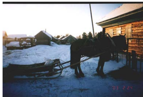
Fig. 1: Topkinbashevo village of the Tobolsk region (Photo from I.S. Karabulatova personal archive, February 24, 2003)

Total: 186 persons. The respondents age from 3-101 years. The youngest one is Ishkulov Ilnaz Izilevich (He was born in 2012), lives in Topkinbashevo village of the Tobolsk region. The oldest respondent is Garifullina Bibikay Abdunadzhipovna (she was born in 1914), lives in Bolshie Akiyari village of the Tyumen region. In the Fig. 1 shown the Topkinbashevo village of the Tobolsk region (Photo from I.S. Karabulatova personal archive, February 24, 2003). The study specified period of expeditions from 2000- 2014 however, observations were made from the mid 90s of the twentieth century but only in 2014-2015 were organized special expeditions. In general, there are a lot of folklore texts but directly related to Attanay and Kurtsak which were recorded by us just 4 texts: