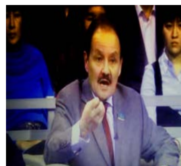
Fig. 2: Zheksenbay Duisebayev (Majilis Deputy of the RK Parliament): Here we need to ask the question Why? (I)

and designs, for example. However, we said. Here I have to say that Zheksenbay Duisebayev, acting as a “legitimate speaker”, tries to emphasize the modality of obligation for the whole system, the whole society (Fig. 1). So he focuses recipient’s attention not only with accentuated emphasis on the words. Here, we need to take into account the fact but also with a “pinch” gesture. In (Fig. 2), to draw attention to his narrative, the politician uses kinetic gesture “index finger upward”, used in 20% of cases of the use of gestures by politicians as a “legitimate speaker”. It focuses the recipient’s attention on how he personally relates to the mentioned events (Fig. 2). The desire to attract the maximum attention of the recipient, using not only the verbal context but also a gesture demonstrates the strong confidence the speaker in his own words. To enhance the sensory impact on the opponents “legitimate speakers” also used the method of “the authority of the person”. The impact of verbal signs increases by specifying the source of the expressed opinion. The most common relevant confirmation gestures in this situation are the various deictic illustrative gestures “point with finger, hands, eyes, head” which make up 20% of the total resource of the “legitimate speaker”.