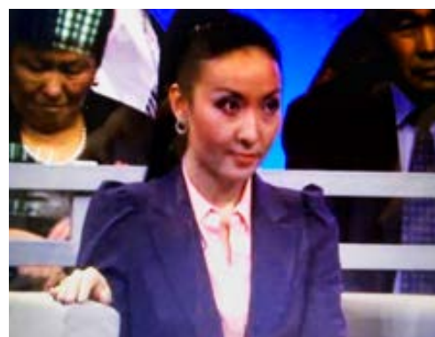
Fig. 8: Nazira Berdaly (Kazakhstani Journalist) (V)