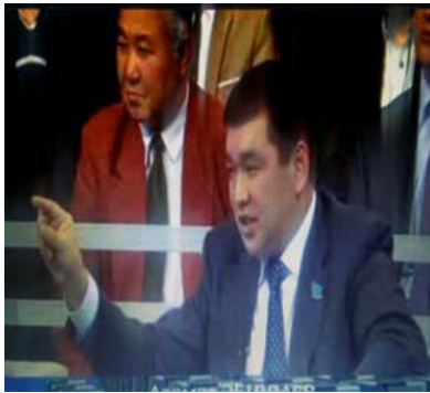
Fig. 4: Azamat Abildayev (Majilis Deputy of the RK Parliament): You said said, that “...” (III)