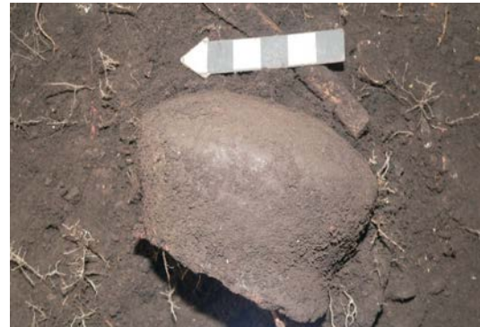
Fig. 3: Pottery found in good condition in the archaeological trench