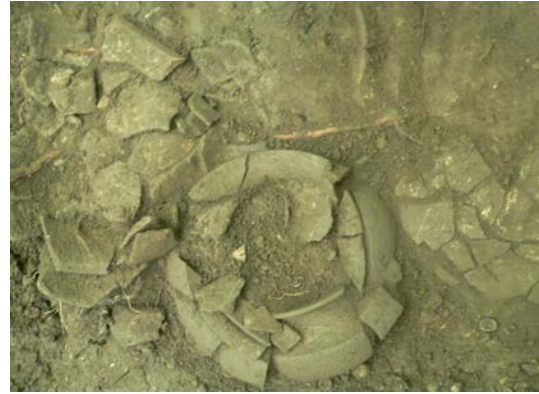
Fig. 2: Pottery found in the archaeological trench

The shells recovered from the excavation were almost similar to the shells obtained during the 1988-1989 excavation. The most common is the bivalve Andaragranosa . Other species such as Pkacuna placenta , Meretrix and Geloina were eaten but less often. These food molluscs were mostly obtained from the mudflats around the site whereas the thick-shelled gastropods that were used for ornaments were probably imported from rocky shore environments (Fig. 2 and 3).