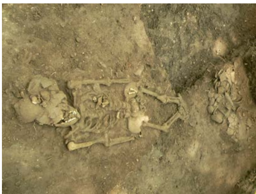
Fig. 4: Human skeleton recovered from the archaeological trench associated with the pottery