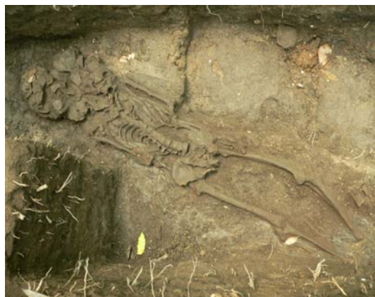
Fig. 5: Human skeletons recovered from Pulau Kelumpang

the upper burials are dated 1450 \pm 40 - 1460 \pm 40 BP. Skeletons found in the lower level dated from 1810 \pm 40 - 1700 \pm 40 BP. It appears as if the oldest skeletons are from 120 AD. The C^{14} Dating showed that Pulau Kelumpang was inhabited continuously by maritime people since the early century. Based on C^{14} Dating that was done earlier by Nik Hassan Shuhaimi, the settlement was in use between 200 BC and about 1500 AD. The extended burial practised by the people in Pulau Kelumpang showed that the community in Pulau Kelumpang still practiced animism as the main belief system (Fig. 4 and 5).