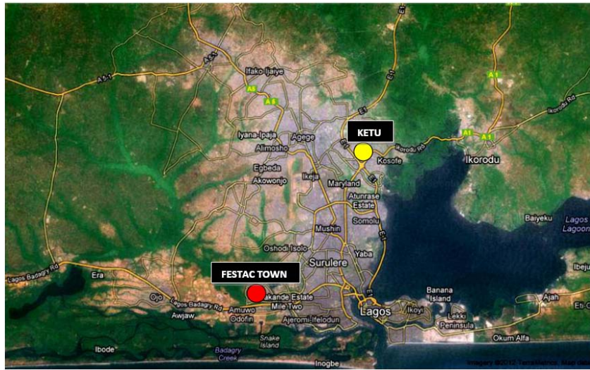
Fig. 1: Location of Festac Town and Ketu within Lagos Metropolis

neighbourhood quality to a great extent determines the quality of transport infrastructure which in turn affects quality of life. However, studies available are limited in scope on the relationship between neighbourhood quality and mobility of the elderly. This study, therefore highlights the variation and the similarities in travel behaviour of old people in a planned and unplanned residential neighbourhood of Lagos with a view to determine if quality of neighbourhood affects mobility and quality of life. The study area in the context of Lagos metropolis is subsequently presented.