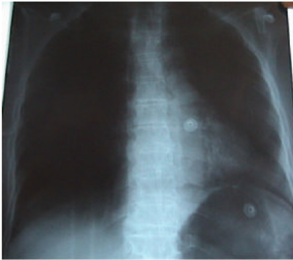
Fig. 1: Chest Radiograph