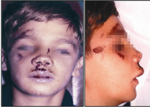
Fig. 1: Multiple extraoral injuries on the face of the 11 years old victim inflicted by abuser's hand; frontal and lateral aspect