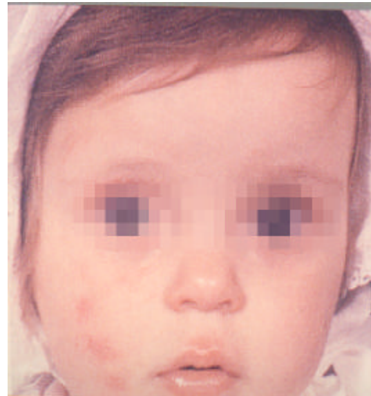
Fig. 1: A hard slap to the face left marks of four fingers of attacker's right hand on this victim's cheek

In this study, a case of a physically abused child, two and half year years old from his mother is reported (Fig. 1).