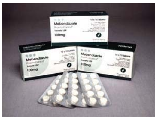
Fig. 5: Mebendazole

Adults and children: PO 100 mg tablet AM and PM on 3 consecutive days.