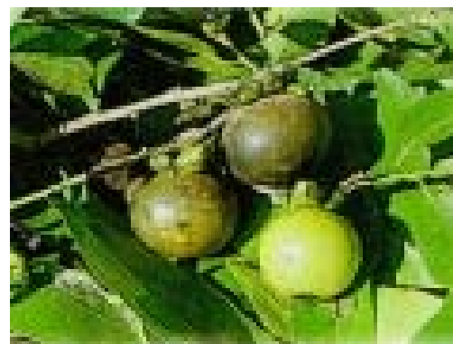
Fig. 4: Diospyros mollis (Griff.) (Ebony tree)