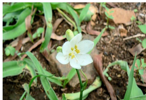
Fig. 3: Croton tiglium Lin. (Purging croton)