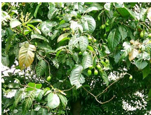
Fig. 1: Terminalia chebula (Retz) ( Samao Thai)