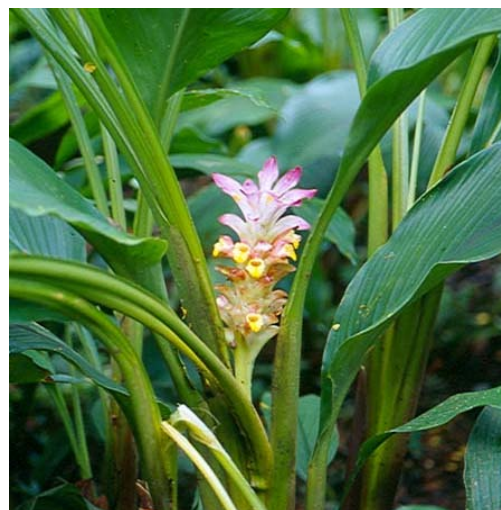
Fig. 2: Curcuma zedoaria (Berg) Rosco. (Kamin Aoi)