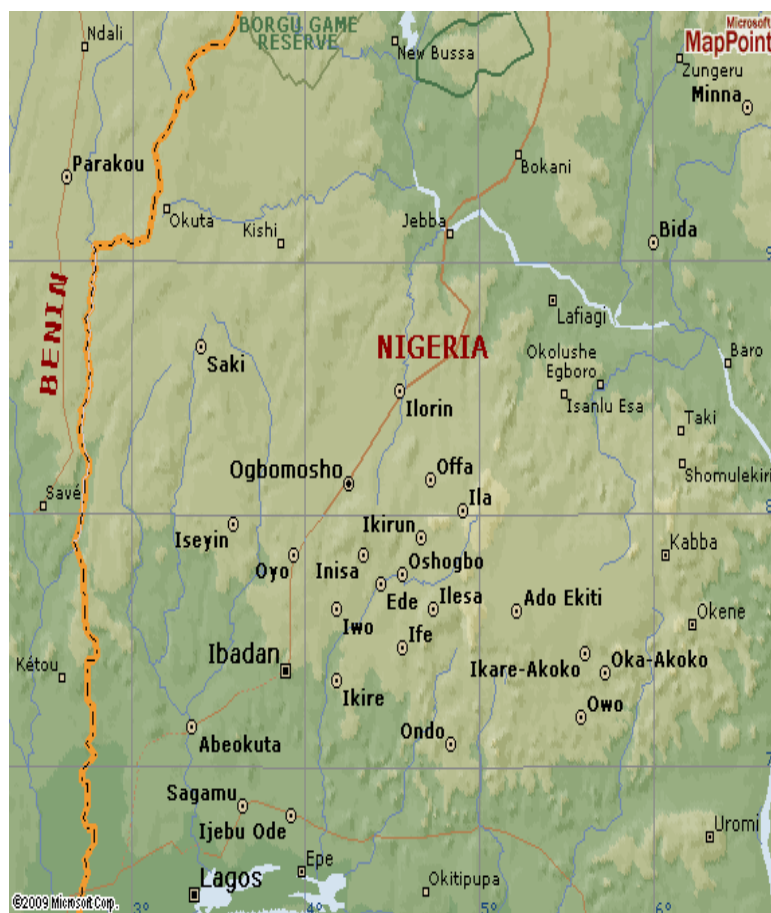
Fig. 1: The map of Southwestern Nigeria showing the various locations where animals were sampled

One hundred twenty samples of pigs were collected from four different locations of >100 km apart. Forty one CBP were from Obafemi Awolowo University (OAU), Teaching and Research Farm (T&R Farm), Osun State; these pigs had a history of >5 years crossbreeding between selected or introduced commercial exotic founder stocks that were contaminated with other breeds of pigs. The remaining three locations contained indigenous pigs. First, 30 NIP were from Ogbooro, Saki Oyo State. Local pigs kept in a mud house were released to roam about the village. This area was dominated by Muslims who do not rear or eat pigs; a few educated Christian families inherited the animals from their forefathers and this, to some extent, restricted infiltration by other breeds of pigs from the neighbouring states. Second, 16 NIP were from the Institute of Agricultural Research and Training (IAR&T), Ibadan, Oyo State. They were kept on a research farm and had regular feeding and record-keeping for each animal. Third, 33 pigs were from Igbara Odo, Ekiti State. These local pigs were allowed to roam about scavenging for survival and they had a history of being reared for over