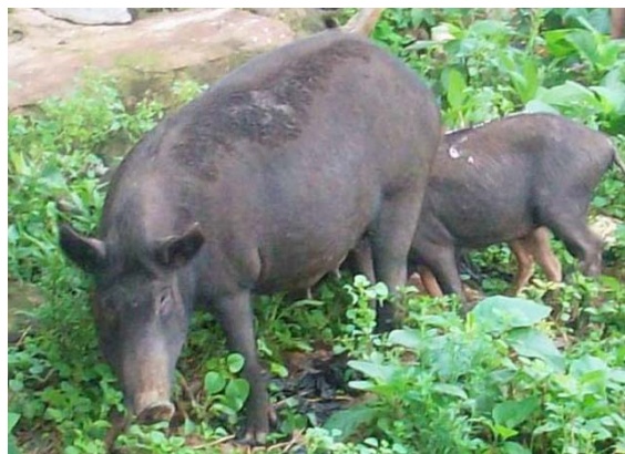
Fig. 3: A representative picture of Nigerian Indigenous Pigs (NIP)

distance between the external iliac tuberosities; Rump Length (RL): the distance between the end of ischion and the beginning of the rump (external iliac tuberosity); Rump Height (RH), the distance between the highest point of the hip bone and the ground; Length of Snout (LS), the distance between the frontal nasal suture and upper part of the snout; Breast Height (BH), the distance between the withers most sloping part and the sternum most curved part; Wither Height (WH), the distance between the highest part of wither and the ground; Body Length (BL), the distance from the point of the shoulder to the pin bone; Interorbital Width (IW), the shortest distance between the two eye sockets; Paunch Girth (PG), the length of the circumference of the pelvic region just in front of the hip; Heart Girth (HG), the length of the circumference immediately behind the front legs; Neck Circumference (NC), the length of the circumference of the neck; Ear Length (EL), the distance between the tip of the ear and the base; Hip Width (HW), the distance between the points of the hip (hindquarters); Shoulder Width (SW), the distance between the points of the shoulder; Tail Length (TL), the distance from the tip to the base of the tail; Live Weight (LW), the live animal body weight and the Teat Number (TN) that observed for the each animal sampled.