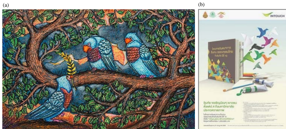
Fig. 7 (a-b): Arts competition of a project called “Imagination, Thai Literature Conservation Contest with InTouch”