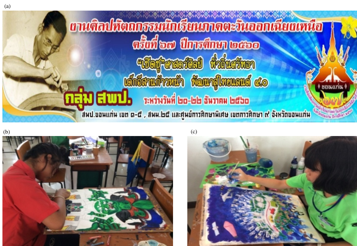
Fig. 3 (a-c): A drawing contest held at the 67th Esan Excellence Fair

Education on December 8-12, 1949 at Suankularb Wittayalai School. The 13th to 33rd events were organized centrally only in Bangkok (Fig. 3).