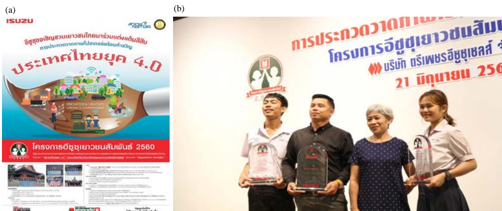
Fig. 4(a-b): Drawing contest of Tri Petch Isuzu Sales Co., Ltd., 2017