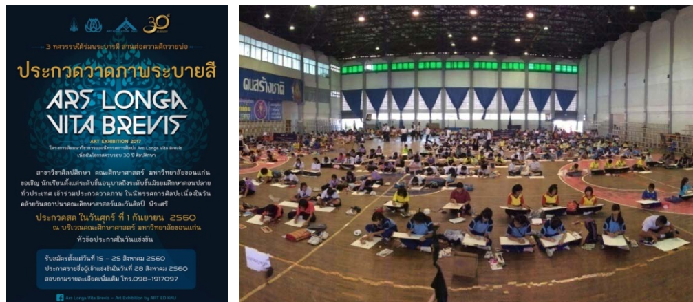
Fig. 1: The 30th Ars Longa Vita Brevis drawing contest