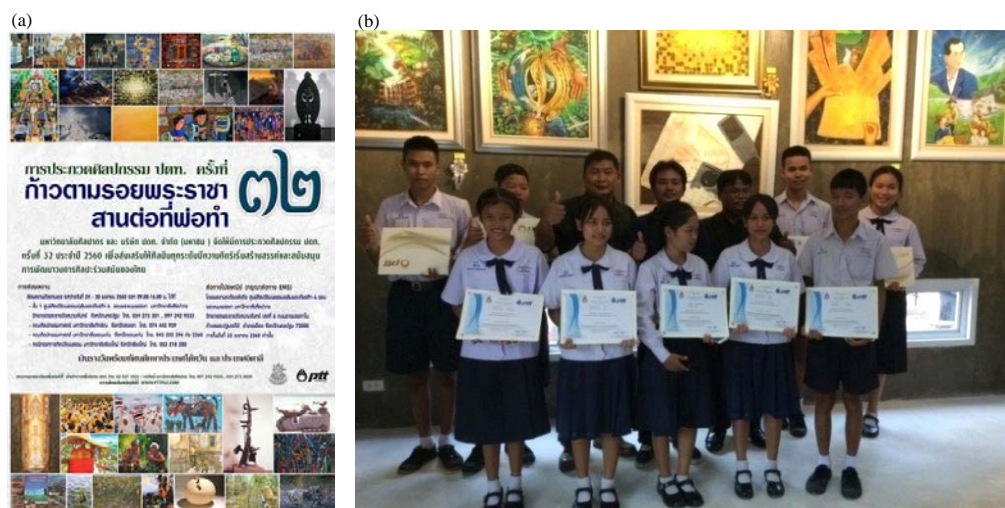
Fig. 6 (a-b): The 12th PTT arts competition for Northeastern youths, 2017

Arts competition in the “Imagination, Thai Literature Conservation Contest with InTouch” project: Being arranged by InTouch Holdings Plc., the arts competition of the “Imagination, Thai Literature Conservation Contest with InTouch” project started its first contest, since, 2006, marking the 11th year in 2017. The competition