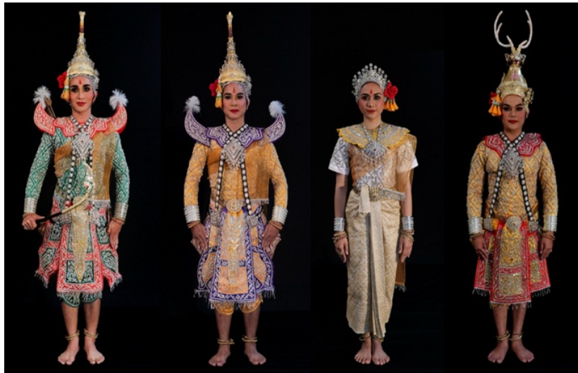
Fig. 3: Costume identities of Rama, Lakshmana, Sita and Kwang Thong in Khon Ramayana dance: ‘Rama Follows the deer’ episode