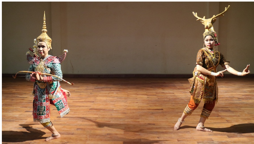
Fig. 4: Dance style of Phra Ram and Kwang Thong (Golden Deer) in the Fon Phra Rak Phra Ram performance, Thanurit episode

Music for Khon performance: Preferably the five-pieced Pi Phat orchestra; including Ranadek (xylophone), Khongwongyai, Taphon, Thai tympani, Bass oboe and Ching (Thai cymbals).