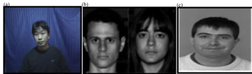
Fig. 2: a) CASIA face image; b) YALE B image and c) FERET image