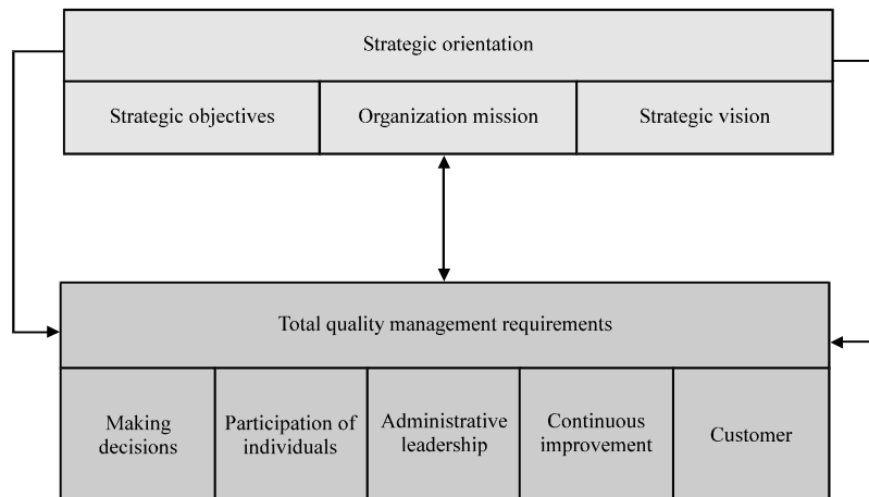
Fig. 1: The model of the study

orientation and the requirements of TQM. The study also derives its importance from trying to determine the role of strategic orientation in the application of TQM. The nature of the relationship between the strategic orientation and the requirements of TQM. This role at the level of the company investigated as well as achieving the following objectives: providing a theoretical study for the management of the company concerned about the strategic orientation and the requirements of total quality management. Description and diagnosis of dimensions of the strategic orientation and the requirements of the overall quality management in the company investigated. Test the relationship between the dimensions of the strategic orientation and the requirements of TQM in the company in question. To test the moral effect of the dimensions of the strategic orientation in the requirements of TQM in the company in question.