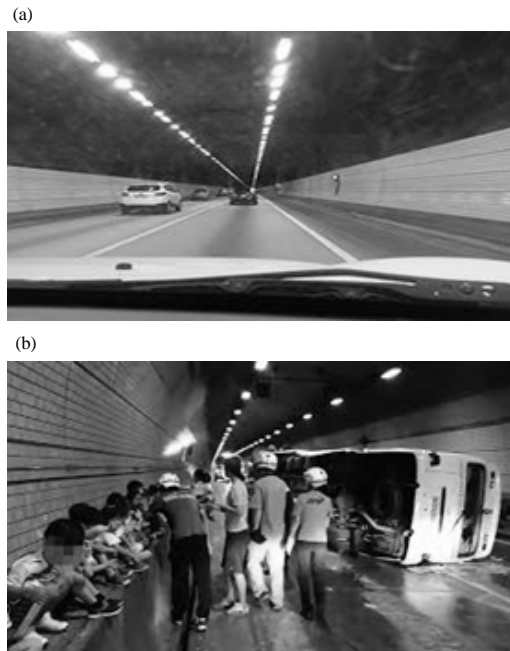
Fig. 1: Drowsy driving accident of highway tunnel: a) highway tunnel and b) Accident of highway tunnel

obtain the accuracy of the analysis of the sound source such sound source was secured and analyzed rather than direct sounding in the internal tunnel of the highway tunnel. First, in the acoustical analysis, fundamental frequency components and energy of the sound were analyzed. We investigated how the sound affects the human body through brain wave analysis. In the Morse test, 5 ordinary people analyzed the response of the sound to the drowsiness sound. Through such analysis and verification, we expect to find a more effective method of eliminating drowsiness (Fig. 1).