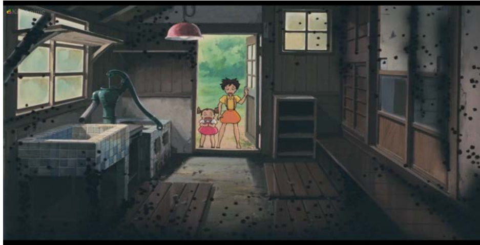
Fig. 11: Small, dark, dust-like house spirits seen when moving starting with light on dim spots