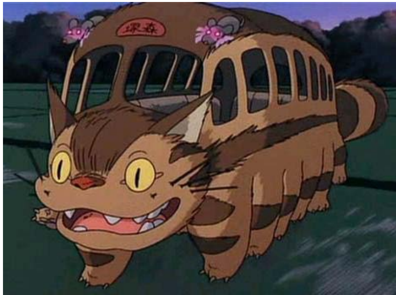
Fig. 10: The colour change to warm, golden, womb-like

need those sun-soaked shades furthermore, listless pace of a spring evening in the country but the manner it melds such components with an unpretentious treatment medicine of the children's tension over their mother makes it a radical novel into a film.