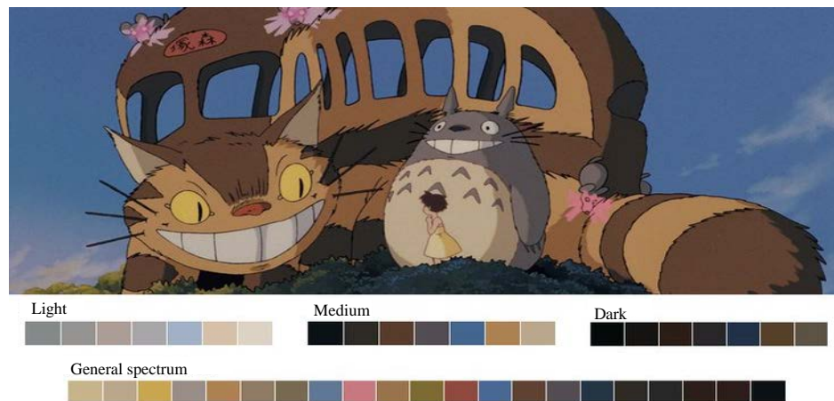
Fig. 13: Scheme colour for Totoro and Catbus