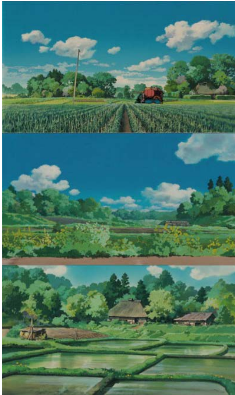
Fig. 6: 'My Neighbour Totoro' interesting visual colour of how character perspectives different

Anderson (2014) It's a novel into a film that has an inclination that adolescence there's generally no simpler path to set it. Mei (3) Furthermore Satsuki (10) about 'My Neighbour Totoro' are elated toward those possibility of beginning another an aggregation in the country and need aid enthusiastic will splash in the delectable scene