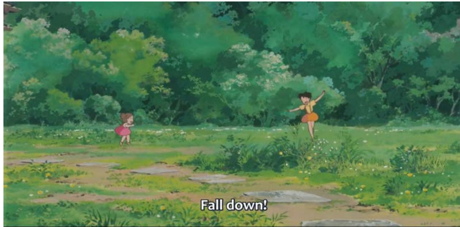
Fig. 9: Tone arm of the film is dreamy and playful