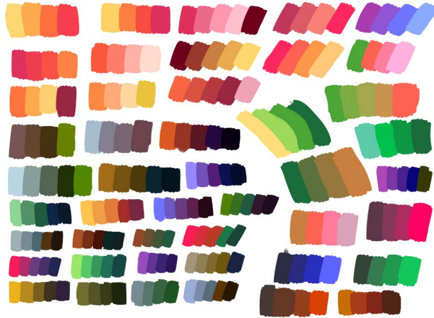
Fig. 2: Colour palette