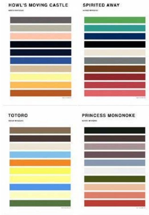
Fig. 4: Most colour palette in anime