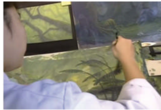
Fig. 1: A girl drawing a picture

Colour: Shades are rich with imagery. This imagery could be clear for how a singular co-partners shades for things, questions or physical space (NAZ et al. , 2009). Colour more light need aid acquainted with us from right on time childhood, they appear to be characteristic and we take them too allowed. A significant number colour inclination alternately colours acquaintanceships for diverse shades