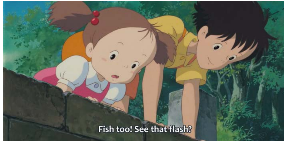
Fig. 7: The colour play important role to perceptive shot