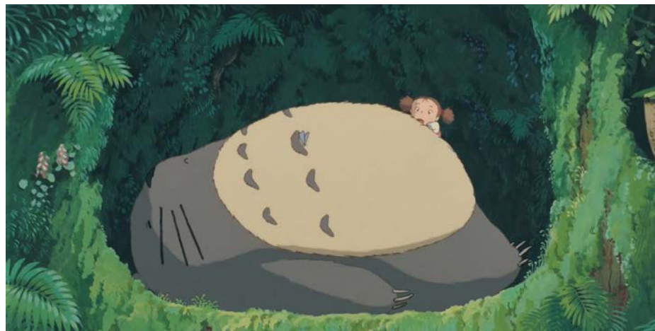
Fig. 8: Person specific scene highlights the vitality about convictions

spaces, the place the sky also clouds need space will inhale. Mei and Satsuki who need aid themselves skilled about finding enchantment for new air more acorns. Those first things these sisters discuss when they land at their new home are the fish in the close-by river and the charming tunnel about trees that acts such as a walk-way up to their house. They are consumed for way like Fig. 7.