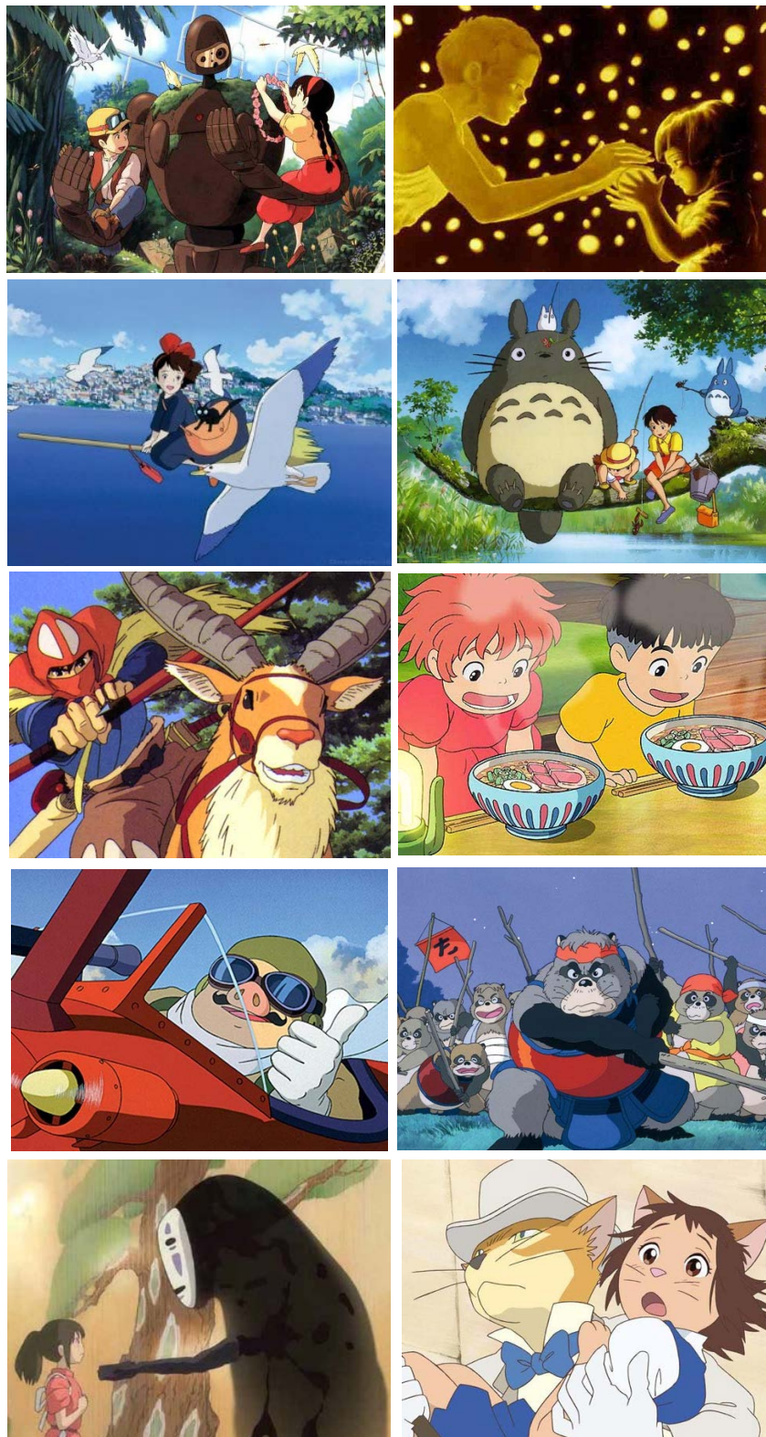
Fig. 5: List Short Anime by Studio Ghibli