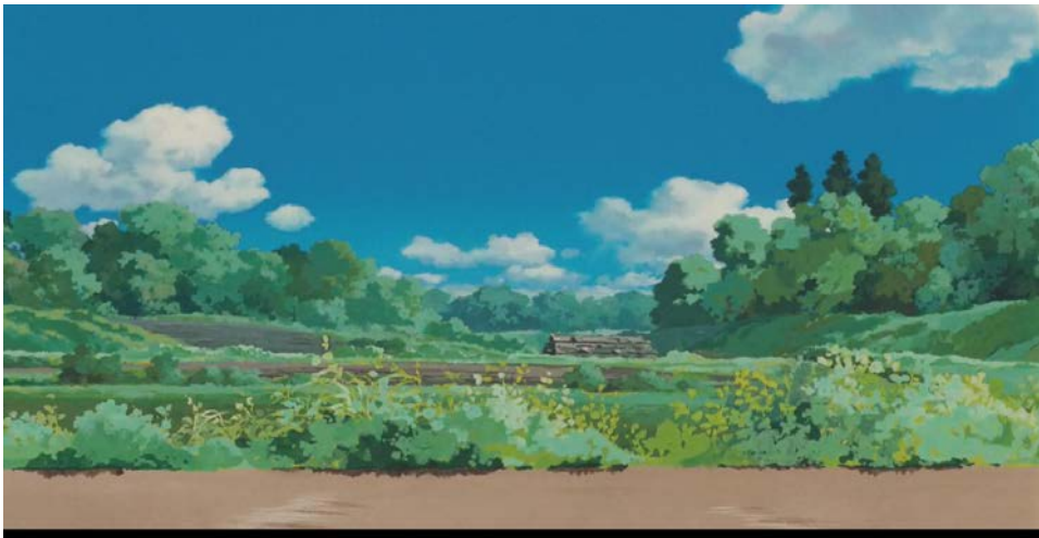
Fig. 3: Scene Sasuki and Mei come first house/neighbor

the scene those characters designs and so, forth throughout this way, observing and stock arrangement of all instrumentation (Moreno, 2014). 'My Neighbour Totoro' vivified arrangement need gave an alternate standard of e dutainment with perfect interactional utilizing different colour technique. In 'My Neighbour Totoro', Studio Ghibli using watercolour technique and others. For example, Fig. 3 using watercolour technique. Studio Ghibli famous with the art of background and technique colouring. Studio Ghibli using scheme colour like Fig. 4. Short anime such as 'My Neighbour Totoro',