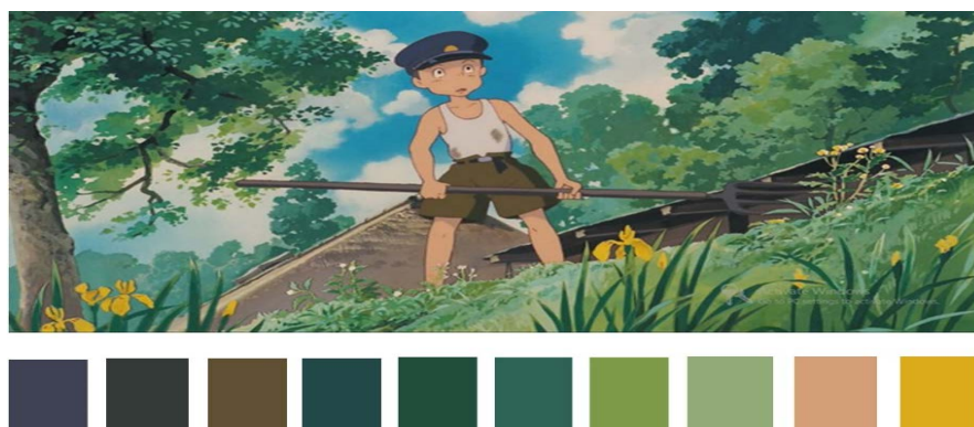
Fig. 14: Colour scheme