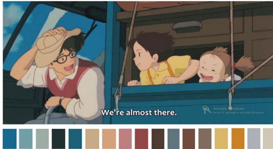
Fig. 16: Scene Kusakabe tell Satsuke they almost arrive at the village

very playful and happy. Their mother talks about the haunted house and Mei asking her mother like or not and her mother answer the question 'yes and can't wait to see ghost' and Satsuki say 'of course mother like and don't worry about that'. Satsuki very optimistic about surrounding her sister. She became positive and confidence. Colour pink as an immature, silly and girlish. Mei personality bright, sweet, caring but a bit immature because she only 4 years old.