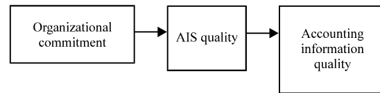
Fig. 1: The conceptual framework

The above theory is reinforced by previous research that is conducted by Sajady et al. (2008) prove that an