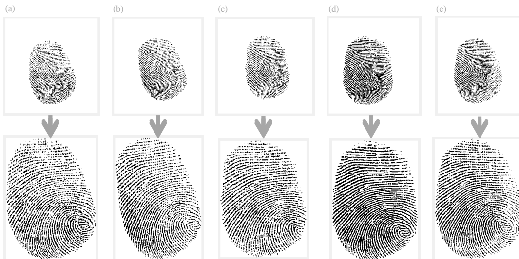
Fig. 6: Binarization and universe of discourse methods