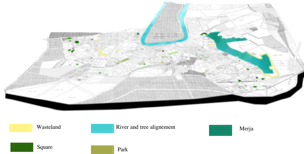
Fig. 1: Existing situation of green spaces excluding green belt and afforestation (Anonymous, 2012)