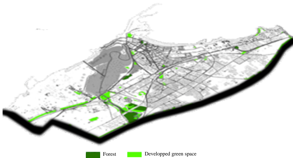
Fig. 3: Current situation of green spaces in the City of Mohammadia

Berlin has many hollow sites and wastelands that provide it with a lot of land reserves to green neighborhoods. After the fall of the wall, the decommissioned industrial areas, the closure of Tempelhof Airport and the abandonment of obsolete marshalling yards offer new opportunities to increase the number of green spaces: formal and informal green space.