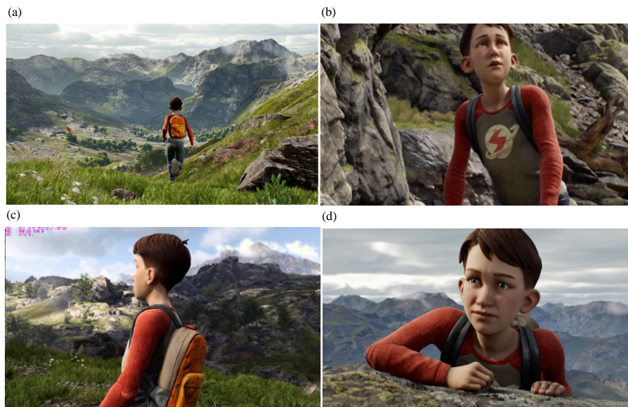
Fig. 3a-d: ‘A boy and his kite’

However, the whole point of this experiment has been greatly influenced unity in future development. Considering the project is done by the team of eight surely surprised the industry. With this experiment, it has shown that what used to require a lot of extra research and features from different resources is now achievable with its current software (Muller, 2017) (Fig. 3a-d).