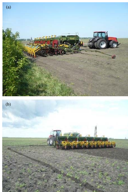
Fig. 3: Modular cultivator drill SKBM-12 with tractor belarus 3022DV; a) General view; b) In operating position

If the domestic sowing rate of wheat is 160 kg/ha, the deviation from actual sowing value is +2.4%. The non-uniformity of seed sowing by pipes of the horizontal divider is \pm 1.3\% . The variability of general seed sowing by the dispenser of seed tank is \pm 1.7\% that is lower than the acceptable one ( \pm 2.0\% ). If the domestic sowing rate of superphosphate is 80 kg/ha, the deviation of actual