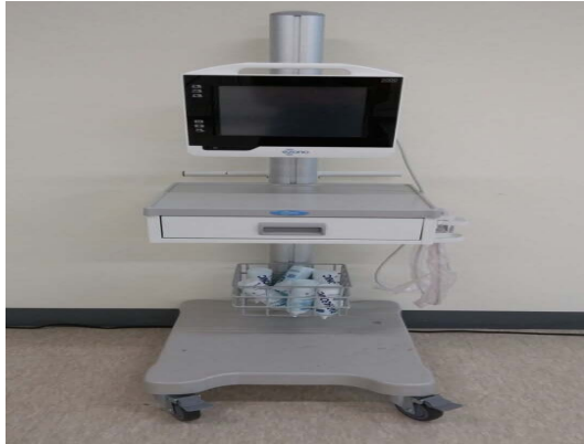
Fig. 1: Ultrasonography