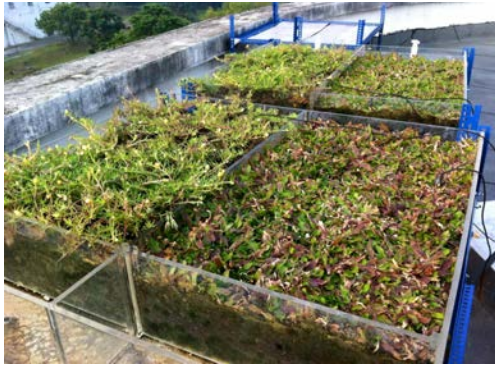
Fig. 1: Experimental green roof test beds at the rooftop level of College of Engineering, UNITEN

Developing the extensive green roof under tropical climate like Malaysia is a challenge because it needs to study the suitable native plants species that can endure the harsh environment of tropical climate. Therefore, there must be research conducted as the way to promoting sustainable lifestyle in Malaysia.