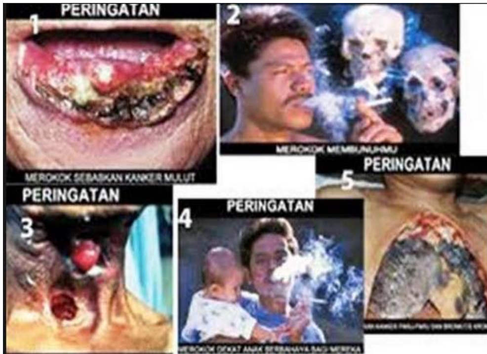
Fig. 1: The five versions of the image of the victorial healt warning used by the government of Indonesia as a campaign warning of the dangers of smoking are noted in each cigarette packs. http://lifestyle.kompasiana.com/catatan/201410/17/gambar-seram-buat-saya-URberhenti-merokok-696296.html )