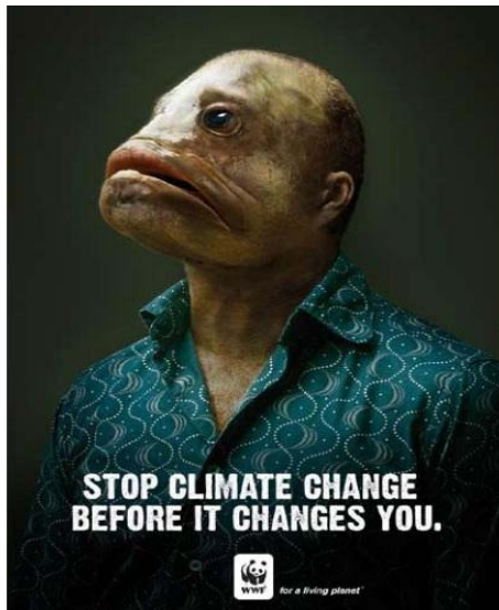
Fig. 4: Example of presentation of visual letter on the argument of an advertisement for WWF on climate change

colour in visual argument, the maker of a poster design for example have the control to use colors to suit the visual context was made. As an example of academic posters using simpler color compared to the popular magazine. Images and graphics; a strong visual element is the part of information into a visually striking and impressive, explained the idea, adding a depth of meaning and the emotions of an argument (Fig. 4).