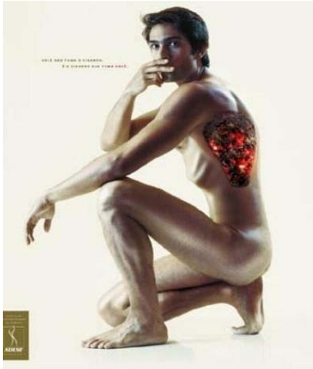
Fig. 3: Dangers of smoking advertising campaigns that use fear appeals approach as visual strategies on public health campaigns