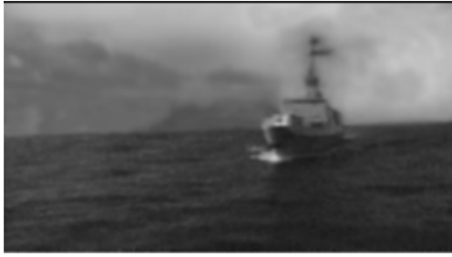
Fig. 2: Filtered image

which may be virtually invisible is described by Santhalia et al. (2009). To accomplish this in this study a nearby particular window channel is embraced to preprocess the picture and after that eight headings Sobel administrator slope strategy and enhanced Hough change are joined to concentrate ocean sky division line in the image, at long last a multi-histogram coordinating system is proposed to evacuate the ocean and sky foundation and accordingly deliver target is extricated from sophisticated infrastructure. A proposed system of ship trajectory control using particle swarm optimization are referred in this study (Sethuramalingam and Nagaraj, 2016). Whatever of this article sorted out as takes after (Fig. 1 and 2).