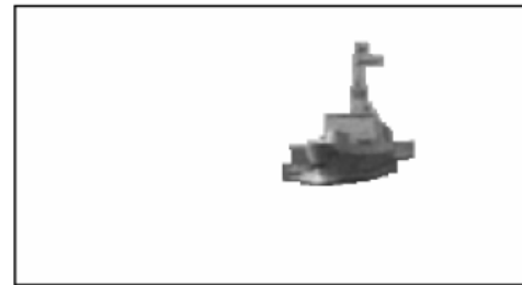
Fig. 5: Extraction of ship target

Multi-histogram matching technique: As said in over, the ship must be lie in the spasmodic area of sky-ocean division line, so the inquiry goes in picture space is compelled in this locale expanded 20 pixels right/left individually. A multi-histogram coordinating strategy is proposed to erase the ocean and sky foundation.