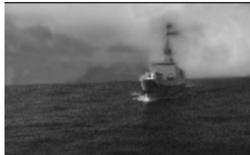
Fig. 1: Ship target in complex sky background

Through the examination of ship target picture in the ocean sky foundation under a far away orthophoria condition we arrive three districts sky area, ocean locale and ocean air division line locale as appeared in Fig. 1. So, if the ship shows up, parts of its region must lie in ocean sky section line area. Safer navigation of ships is discussed by Santhalia et al. (2008). Along these lines with the assurance of sea air division line area, the computational amount of ship target group can diminish in the meantime the insignificant clamor evacuated. Feature extraction and target recognition is discussed by Zhang et al. (1991). We have arranged the boats as indicated by their sort by taking ongoing pictures without taking elaborate foundation. However, here we have anticipated doing on sophisticated infrastructure thus, a line projection histogram to find the ocean sky division line. Locating horizontal region of an infrared image is described by Zhang et al. (2005). This technique just applied to a basic foundation and the parallel limit is hard to decide. They additionally proposed another strategy which figures the usual of line pixels and the maxima of segment bearing angle affirming the area. Laser and infrared is discussed by Liu. In any case, they can't consider the inclination of the ocean sky division line. Likewise, they neglected to administer to the unsettling