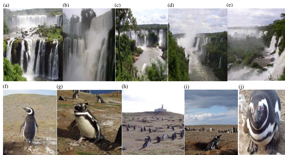
Fig. 2: Set of images with their text description: a) <DESCRIPTION> view of giant waterfalls in the middle of the jungle; <DESCRIPTION>; b) <DESCRIPTION> voluminous bodies of water are falling in the middle of the jungle; <DESCRIPTION>; c) <DESCRIPTION> view of giant waterfalls in the middle of the jungle; two boats in the water and a tree in the fore ground on the left; <DESCRIPTION>; d) <DESCRIPTION> view of giant waterfalls in the middle of the jungle; <DESCRIPTION>; e) <DESCRIPTION> numerous giant, thunderous waterfalls in the middle of the jungle; <DESCRIPTION>; f) <DESCRIPTION> a penguin on a brown, bald island with many other penguins in the background; <DESCRIPTION>; g) <DESCRIPTION> penguins on a brown, bald island; <DESCRIPTION>; h) <DESCRIPTION> penguins on a brown, bald island with a lighthouse in the background; <DESCRIPTION>; i) <DESCRIPTION> a penguin in his nest on a brown, bald, rocky island with many other penguins in the back ground; <DESCRIPTION> and j) <DESCRIPTION> close-up photo of a black and white penguin; <DESCRIPTION>

The 80% of the collection of images text descriptions was grouped for training process and 20% were left for testing process. The results were encouraging through obtaining a good outcome of those topics that describe the images collection. The held-out probability estimation was used for evaluating the tested images as shown in Fig. 2a and j for a set of images with their description taken from IAPR TC-12 benchmark dataset. And the resulted topics in terms of 8 and 5 words in each extracted topics as listed in the.