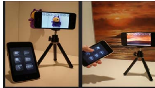
Fig. 1: “Auto cam lite” for i-Phone

Despite the rapid performance improvements of such cameras, software using a camera is not greatly