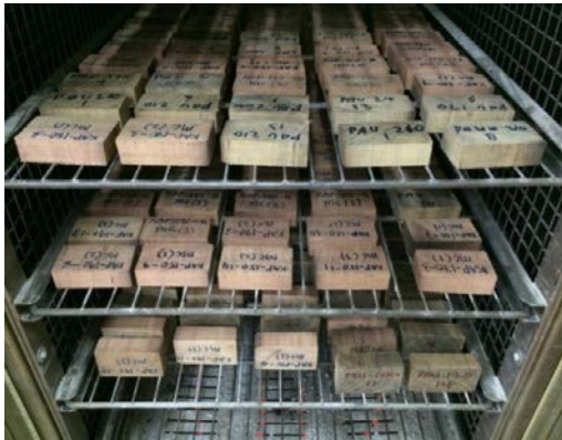
Fig. 3: Sample placed in oven

105+2°C. The weight then been recorded again once all of the specimens been removed from the oven after 24 h.