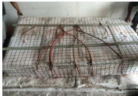
Fig. 1: Specially designed electrical furnace made up from ceramic fiber

After the heat treatment had been done, each sample from both species was cut from the three part of mid span of specimen for moisture content testing. Moisture content of timber is amount of water inside of timber which been expressed in percentage. The oven-drying method has been the most universally accepted method