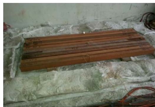
Fig. 2: Arrangement of samples inside the electrical furnace

for determining moisture content of timber but it is slow and requires cutting the wood. Specimens for determining moisture content were prepared with specimen dimension of 25 mm thick, 50 mm wide and 90 mm long. The procedure of testing for the moisture content is in accordance to Malaysian Standard, MS 544:2001, "Method for Determination of Moisture Content of Timber" by using formula in Eq. 1: