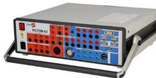
Fig. 1: Test complex RETOM-61

Let us first consider the existing equipment for testing and adjustment of relay protection and automation devices that is used in the adjustment organizations, in RPA services for maintenance of substations and electrical networks. The most common domestically produced equipment in addition having the broadest options are RETOM tomography relays of models RETOM-21, RETOM-51, RETOM-61 (Fig. 1). There are also widely used testing units MICRON, relay protection testing devices of series “Neptun” (“Neptun”, “Neptun-2”, “Neptun-3”), series “Uran” (“Uran-1”, “Uran-2”), devices UNEP-2000 for testing electric equipment protection used in 6-10 kV substations. There should be noted such foreign equipment of this class as devices Omicron CMC 356, T-1000 PLUS and T-3000 manufactured by company ISA, DRTS 64 and DRTS 66. Features of individual models of the listed above equipment are significantly different but almost all of them have: