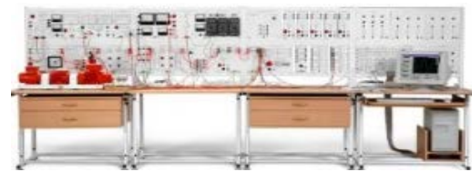
Fig. 5: The appearance of the electrical system model EE2-RZAES-S-K

The disadvantage of the physical model is the large weight and dimensions which however, is not so critical for fixed installations. In addition, the parameters of the model elements can be varied in a relatively small range and the list of items is limited by a manufacturer's