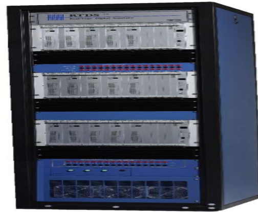
Fig. 3: The full-size version of RTDS cubicle

The most powerful, famous and widespread among software and hardware complexes for real-time modeling of electrical systems is the RTDS. Complex RTDS is used by many of the world's leading manufacturers of electrical equipment, relay protection and control devices (ABB, AlstomGrid, GE, Siemens, etc.). It provides both open loop testing (i.e., reading in COMTRADE format or the open-loop simulation) and testing in a closed HIL cycle (with feedback) (Zakonshek and Slavutskiy, 2012). RTDS has an extensive library of components of a power system and control systems, including power electronics elements, HVDC, STATCOM and other devices. RTDS has a modular design: a set of cartridges (cubicles) each of which includes processor boards and communication boards (Fig. 3). If the network size exceeds the capacity of one cubicle it must be broken down into subsystems then each cubicle will perform calculations for its subsystems. The maximum size of a network solution is 72 single-phase nodes, two network solutions can be modeled on the same cubicle (Zakonshek and Slavutskiy, 2012). The graphical user interface is implemented as a RSCAD