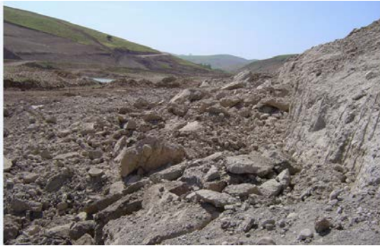
Fig. 8: View of South East conglomerates that are very similar to the Bakhtiari conglomerate