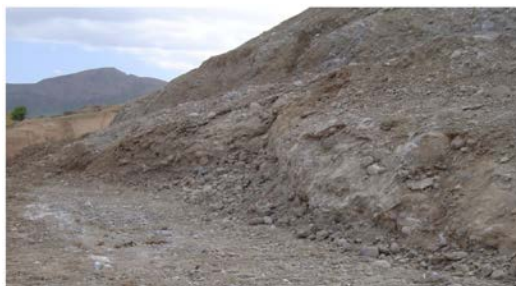
Fig. 6: Close view of polio pleistocene conglomerate protrusions in the south of the case study area in the picture the texture of the conglomerate and litchis fragments are visible