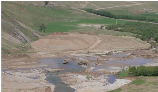
Fig. 12: View of the sediments of the surface of Herod River