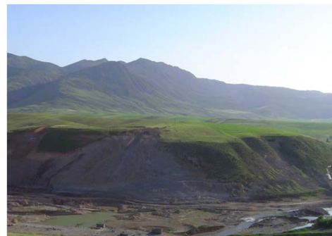
Fig. 2: A view of mountains surrounding the Eyvashan dam site