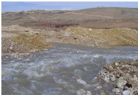
Fig. 3: Pleistocene conglomerate in the place of Eyvashan dam site on Herod river in the Southern village of Eyvashan

Tectonic: In this study, in order to identify the tectonic and seismic tectonic range of designs, features of ground-build are provided on a large scale. In this regard,