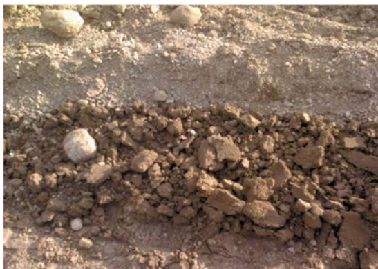
Fig. 9: The progress and fine-grained sedimentary cover of antiquity (Qt) on the conglomerate (PLQc) on the right-hand edge of khoram Abad-Brojerd road not far from the bridge Herod