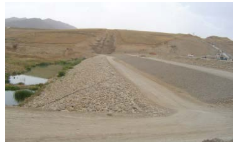
Fig. 1: Cofferdam upstream of Eyvashan is building

Definition of the problem: In terms of geology the metamorphic zone in the North East of this region with the face of a dark gray to black, organized from the hills and low post. Included rocks are mainly metamorphic and injected intrusive rocks in them (such as Broujerd intrusive) are sometimes seen as a building ridge have been exposed so spectacular (Fig. 2). Eyvashan dam site from the new perspective on a range of tectonic and seismic tectonic is located aggressive. Including new signs of tectonic movement can mentioned the present and active faults in the quaternary on a regional scale such as part-fault of Dorood and fault Peace in the mountains (BHRC, 1999).