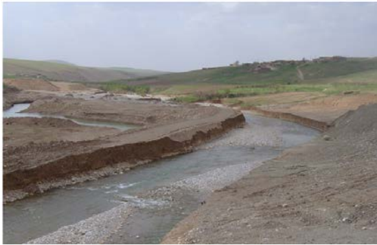
Fig. 7: Conglomerate walls with a slope of 40 with a series of closed joint linear that their path is determined by herbaceous plants that is visible on the riverbank of Herod