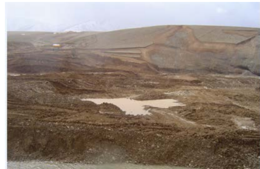
Fig. 4: View of the under construction dam site conglomerate of Eyvashan

These studies show that among the detected faults, the North of Safarabad fault (with a length of 12 km