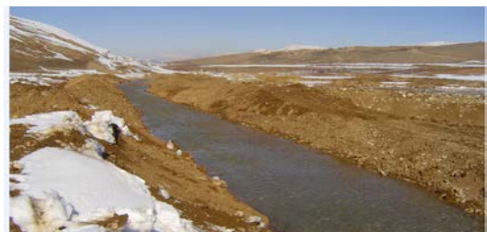
Fig. 5: The pleistocene conglomerate