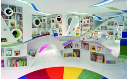
Fig. 4: Track and indent. Bookstore kid's Republic, Beijing, China

or malfunctioning, makes the word of the creator formal or informal, literary or scientific, humorous or serious, direct or indirect, simple or casual and so on (Abbas, 2014).