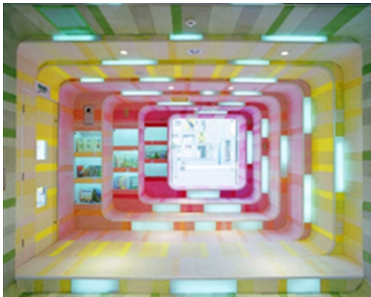
Fig. 5: The bookstore kid's Republic, Beijing, China (www.designrulz.com)

between the two linguistic events. The simplest type of communication that can be assumed between the two events and consider the physical interpretation for it in architecture, is contrast: light, shadow, roughness and softness are materials example of this contradiction, in the form of architecture. This clear connection between the two events is simply visible and understandable by children (the audience with little prior experience).