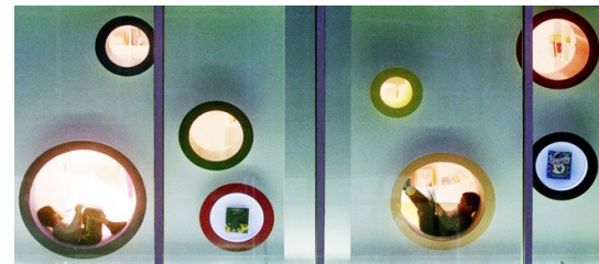
Fig. 2: A space of their own. Bookstore Kid's Republic, Beijing, China