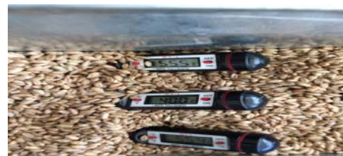
Fig. 4: Temperature measurement wheat

practically does not depend on the frequency of the current already and is determined by the ratio between the