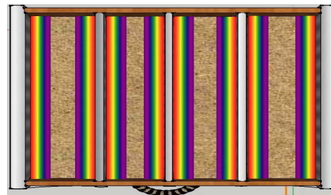
Fig. 3: The 3D model