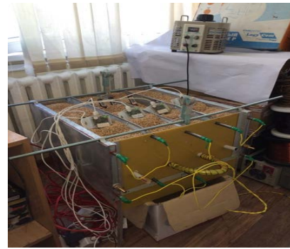
Fig. 2: Model the experimental setup