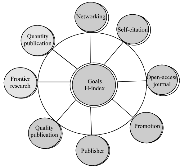
Fig. 1: Components that contributed to the increase in H-index

Impact factors value have a big impact on the H-index. This is because almost 100% of the journal listed in Q1 and Q2 has the focused scope and all journals in this group have high values of impact factors. Therefore, researchers are encouraged to publish in journals that the scope of its field is focused if you want to increase the value of the H-index. The higher the value of impact factor, the higher the probability of the study is referred and quoted. Next, the value of the H-index can be improved. Evaluation of research groups and individuals