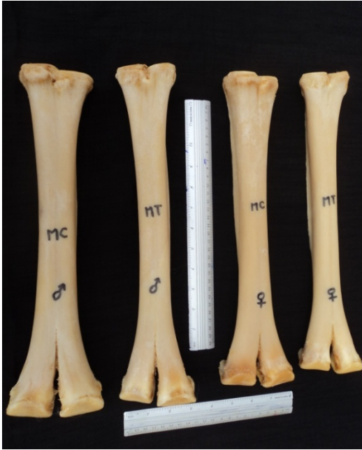
Fig. 3: Dorsal face of male and female adult left metapods, metacarpus (TM) and metatarsal (MT)