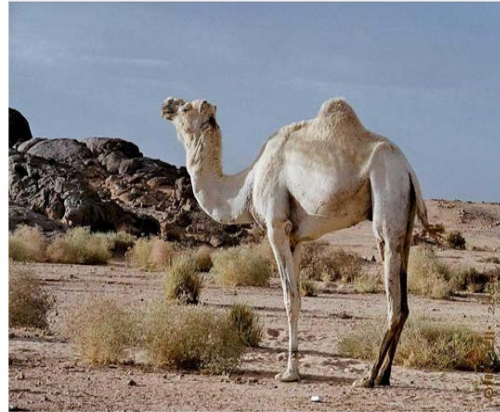
Fig. 1: Dromedary Targui population

NB: For the determination of the age, we used the experience of breeders and butchers by examination of the dentition which remains the most common method used by camel riders.