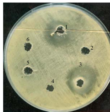
Fig. 3: Inhibition of Lc. lactis subsp. lactis LCL09 by LCL01 culture supernatant by the agar well diffusion assay. Wells contained cell-free supernatant was treated: well 1: at pH 7, well 2: heated for 60 min at 120°C well 3: adding catalase (1 mg mL -1 ) well 4: adding trypsin (1 mg mL -1 ) well 5: adding α-chymotrypsin (1 mg mL -1 ) and well 6: adding protease (1 mg mL -1 )

Spectrum of activity: We tested twenty strains to other species including bacteria of Gram-positive