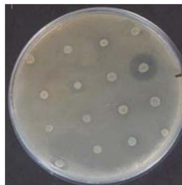
Fig. 4: Spectrum of action of LAB against E. coli . (Only one strain inhibit E. coli is Lactobacillus plantarum LBP01)

( Enterococcus , Bacillus cereus and Staphylococcus aureus ) and bacteria of Gram-negative ( E. coli ). According to Tagg et al. (1976), the spectrum of activity of the bacteriocins bacteria Gram-positive, although it can be variable according to the strains, never relates to the bacteria Gram-negative. Our results showed that the bacteriocin-like do not inhibit the growth gram-negative bacteria such E. coli . Also with an aim of determining the field of activity of the antibacterial substance produced by, the sensitivity of various bacterial strains to this antibacterial substance is evaluated. On the other hand, E. coli is the only one which been affected by the inhibiting substance produced by Lb. plantarum LBP01 (Fig. 4) which has a characteristic of the bacteriocin-like. Bacillus cereus and Staphylococcus aureus were inhibited by fourteen tested strains.