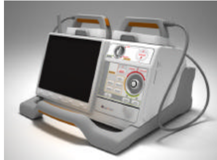
Fig. 1: Transcutaneous cardiac pacemaker (Orange-1, Mediana Co., Ltd. Korea) used in this study

Protocol for transcutaneous cardiac pacing: An automated external cardiac pulse generator (Orange-1, B400, Mediana Co., Ltd. Korea) and a transdermal electrode (Mediana Co., Ltd. Korea) were used for TCP (Fig. 1). Five dogs underwent TCP for 1 h (short duration treatment). For each dog, TCP involved application of 5 mA of pacing current/kg of body weight (with 20 msec of pulse duration) via transdermal electrodes (surface area, 40 cm 2 ) in the left apex-right apex positions (electrode placement over the costochondral junctions of the fourth to seventh ribs on the left and right sides, respectively) at a heart rate of 120 beats min -1 ; this rate was selected because the mean±SD heart rate among the study dogs was 114.4±12.4 beats min -1 . The success of the TCP was confirmed by the presence of spike impulses detected via ECG, the continuous formation of pressure waveforms confirmed via aortic pressure measurements and left ventricular contraction detected via M-mode