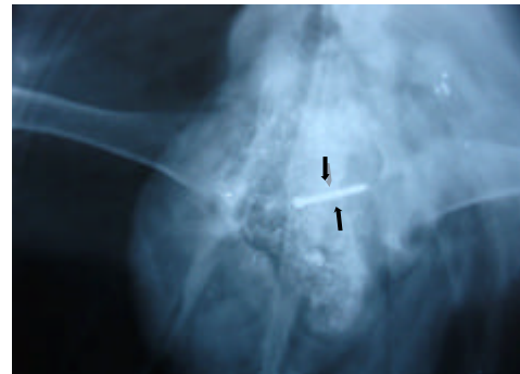
Fig. 1: The abdominal position of the FB in the case seen on ventro-dorsal X-ray (arrows)

Description of the case: A 10 weeks old, 2, 4 kg, male domesticated goose was presented to the faculty clinics. The owner informed that general condition of the goose was gradually worsening in last 10 days and water intake was decreased within a term debilitatiting the case to stand on foot. In clinical examination, none of any or bone fracture was found but the weight loss