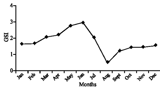
Fig. 1: Monthly variations in the GSI values of female of tench in Seyhan reservoir

Water temperature ranged from 20-31.6°C for the spawning period beginning of May end of August in Seyhan dam lake. The investigation of the main spawning period of tench was base on the GSI (Fig. 1). The highest GSI value occurred in June and the lowest in August. The numbers of mature and immature individuals are shown in Table 1. They reach the sexually maturity at the age of II in the Seyhan reservoir. Mean egg diameter was highest in June and smallest in August (Fig. 2). It was determined that egg diameter reached the maximum value