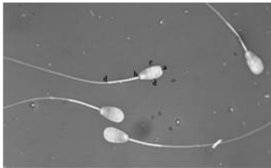
Fig 1: The vision of sperm cells were clear and sharp. The borders of mitochondria and heads were easily seen. The border of the middle piece and principal piece was clearly seen due to the termination of the thick mitochondrial helix (d). The distances between a-b were accepted as head Length (L); c-d accepted as head Width (W) and b-d were accepted as Mitochondrial Length (ML). According to these measures, ellipticity (L/W) and elongations [(L-W)/(L+W)] were calculated

On each slide, around 50 sperm cells were measured according to their head length, head width and the mitochondrial length of by using Manufacturers software (Leica IM50, version 4, copyright 1992-2004) have been installed on the computer connected to the camera. The scale was 5 µm and already calibrated by Leica.