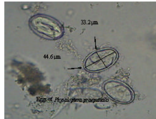
Fig 3: Eggs of Physaloptera praeputialis (Moticam 10X)

The nematodes were whitish pink in color with lengths between 25 and 34 mm, a diameter of 0.8 mm, an extension of the cuticle similar to a prepuce on the anterior extreme of the body (Fig 1) and a bilabiate head characteristics of the order Spirurida (Cordero et al. , 2000). Figure 2 shows the cuticular extension that covers the