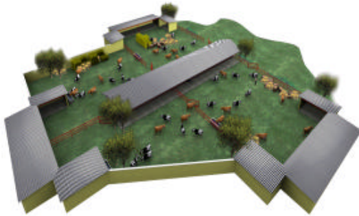
Fig. 2: Perspective view of new designed micro animal housing

comes to the animal housing from different speeds and directions. For this purpose, two small weather stations (Hobo weather station) were used. With the weather station that was installed on the inside and outside of the shelter, the data relating to air speed and direction was continuously recorded. In the shelter, measurements were made in different points at height related to animal levels, for the outer wind speed values, which formed inside. The weather station memory is 512 KB and air speed sensor measurement range is 0.44 \text{ m sec}^{-1} , resolution is 0.19 \text{ m sec}^{-1} and accuracy is \pm 3\% . In climatic measurements, the data was recorded with 10 min intervals. Between 5000-12000 air speed values were analyzed in each points for a total of 33,000 values at each 4 points. The research was carried out for a year.