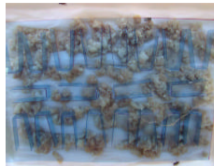
Fig. 1: Eggs collecting tray containing smelly meat, covered by the sheet of hiding spaces

encircle it with elastic band. This is to allow ventilation and prevent newly hatched larvae to escape. Make drainage at the bottom of the jar, cover it by similar rag of the top mouth. This will help draining out the continuously accumulating debris of maceration (Fig. 2).