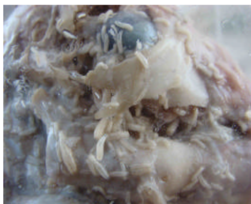
Fig. 3: The process of maceration of 100 days old of goat's fetus head by fly larvae

The incubation box: In case of cold weather, an incubation box (preferably polystyrene box) equipped with fish aquarium heater and thermostat, supplying the box with controllable source of heat, necessary for the larvae to survive.