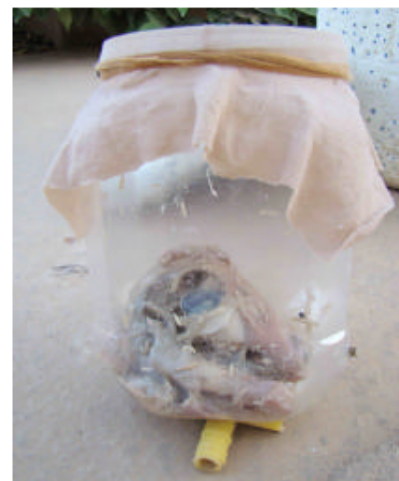
Fig. 2: Maceration jar containing specimen with fly larvae