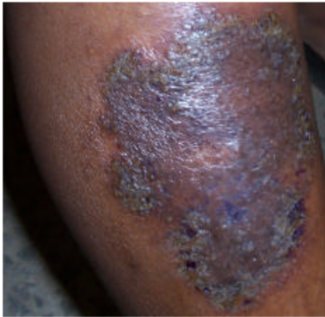
Fig. 3: One case of Tinea corporis shown in the clinic