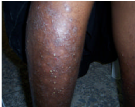
Fig. 4: The case of Syccosis cruris shown in the clinic