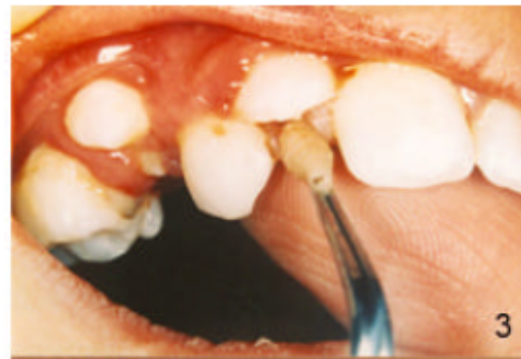
Fig. 3: The live maggots (larvae) while being removed from the lesion