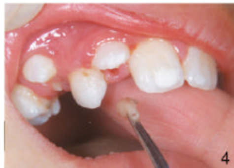
Fig. 4: Removed larvae is shown with its empty site on palatal surface of 12