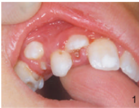
Fig. 1: The site of the larvae before any attempt for their removal

The live and active larvae was then stored in an isotonic saline solution and sent to a parasitology laboratory, where the larvae was nourished and in less than a week it was changed to a mature fly (Fig. 5).