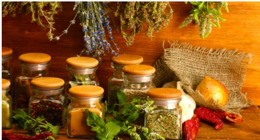
Fig. 4: Traditional herbs in use

and perhaps elsewhere in the world. Safety is critical and requires better chains of custody and product characterization that exists at present for these products, particularly those involving global markets. Efficacy that is that the health promotion claims for the product are true and not misleading is also critical. Demonstrating efficacy requires clinical studies with well defined products and rigorous experimental designs and the studies must be replicable. To that end, many publishers now require that submitted manuscripts comply with established guidelines for the reporting of clinical trial results (e.g., Consort guidelines) while funders require demonstration of product integrity by applicants (Anonymous, 2018a-c; Sebastian et al. , 2017). Finally, there are issues of personal choice and values, sometimes involving the efficacy of supplements as complementary and alternative therapies that are part of a larger philosophical or religious world views and systems. These must be accommodated without abandoning safety.