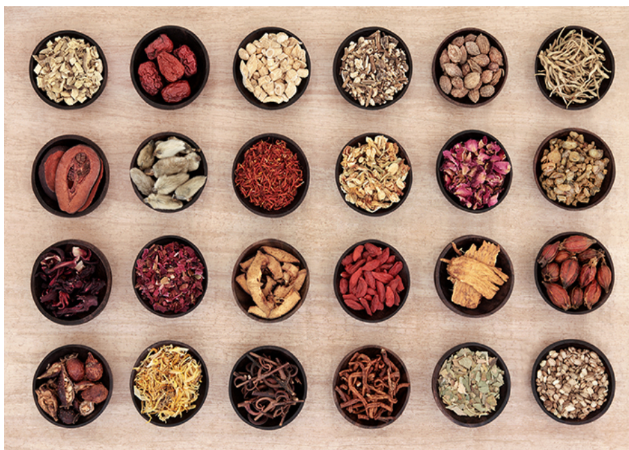
Fig. 1: Dietary supplements

the lucrative nature of the global dietary supplement sector, increased involvement of a growing industry sector producing them and the introduction of many new and innovative products onto the market. A detailed discussion of the politics of the subject is outside the scope of this paper. However, it must be recognized that politics may play both a positive and negative role in shaping both regulatory frameworks and research agendas. Irrespective of the reader's point of view, this context is important in any discussion of dietary supplement products (Fig.1).