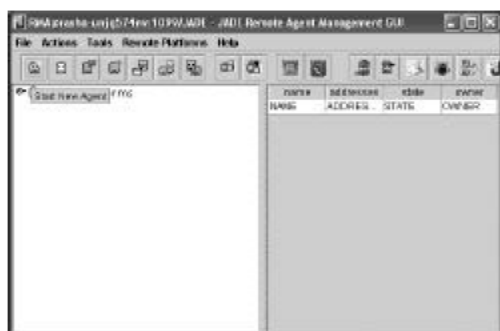
Fig. 2: Homepage of JADE GUI

Possible benefits and outcomes from this research: The main aim of this research is to design and implement a novel routing scheme based on mobile agent technology in wireless Ad-Hoc networks that will provide the following benefits. Maximize network performance, scalability, provide end-to-end reliable communications and reduce possible delays and minimize losses that may incur due to bit-errors and handoffs. Another very important issue that